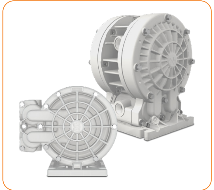
Velocity Series AODD Pumps have an extremely low startup pressure of 15 psi (1.03 bar) and produce a dry suction lift of up to 16 feet (4.9 meters).

Due to the space constraints that many OEMs face, the pump must fit easily into the system's existing infrastructure with minimal repiping or remodeling needed. The rule of thumb in this case is that the pump must be flexible enough to work within the system's requirements, rather than the system being forced to work around the new pump. Simply put, adding a new pump that requires a system redesign with its inherent costs is difficult for the OEM to swallow.